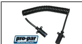
PROEL1212B Coiled electric, 12', non-ABS, 12" lead, Xenoy, black