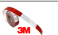
MMM981-32-2 reflective tape, red/white 2" x 150' roll, Diamond Grade, 3M