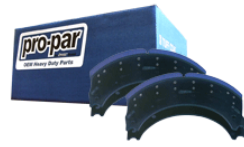
PROBKE4707Q20STD brake shoe kit, 4707 relined "Q+" kit w/20K standard lining