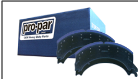
PROBKE4707Q23PR brake shoe kit, 4707 relined "Q+" w/23K premium lining

Valid February 1, 2012 - February 29, 2012