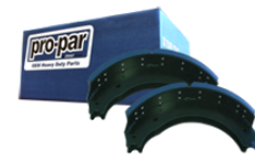
PROBKE4515Q20STD brake shoe kit, 4515 relined "Q" kit w/20K standard lining