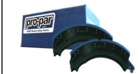
PROBKE4515Q23PR brake shoe kit, 4515 relined "Q" kit w/23K premium lining